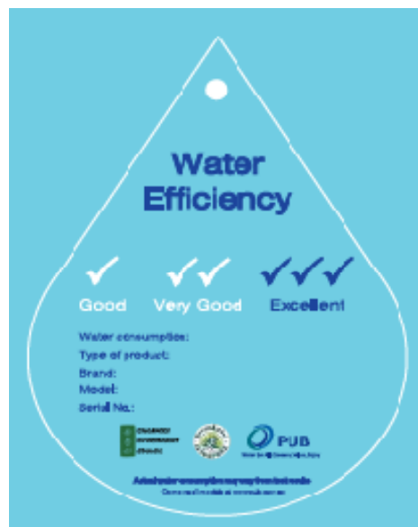
Figure 2: Water Efficiency Label for Voluntary WELS