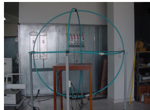
MAGNETIC FIELD ANTENNA

100 ~ 240 V Single phase & 3 phase 50 Hz 20 KVA Max.