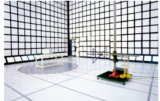
10 m SEMI ANACHOIC CHAMBER