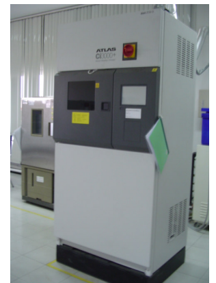
Xenon - Arc

For more information, please send your queries or contact us at the following: