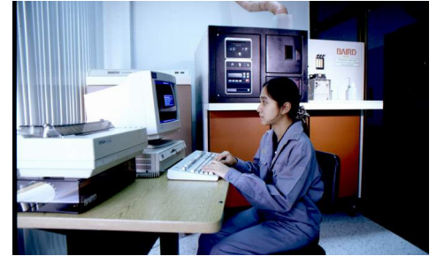
Analysis Sample with Inductively Coupled Plasma (ICP)